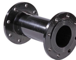
Weld Neck Connection