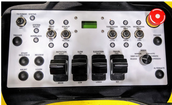
iTONG™ Miratron Radio Remote Control (MRCC)

The MRRC provides remote operation of the iTONG™ from a safe distance of the tool. The maximum expected operational range is 100m.