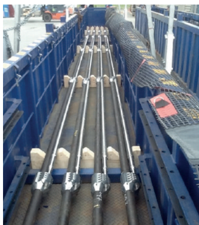
CaTS gauges mounted on the tailpipe